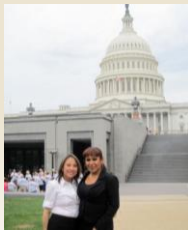
Members of JDI's Survivor Council in Washington, DC.